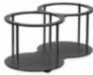
Bottle stand 1 x 2 configuration Wellwash