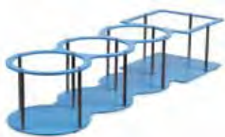
Bottle stand 1 x 4 configuration Wellwash Versa