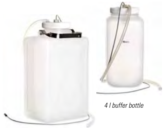
9 l waste bottle