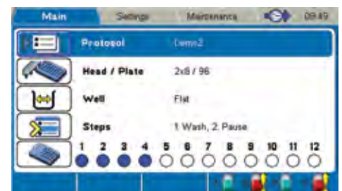
Wellwash Versa user interface - main view