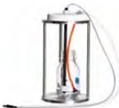
Bottle stand for user bottles