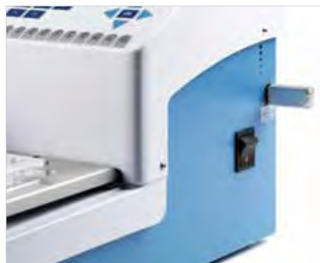
Wellwash Versa with a USB flash memory stick