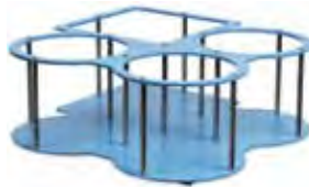
Bottle stand 2 x 2 configuration Wellwash Versa