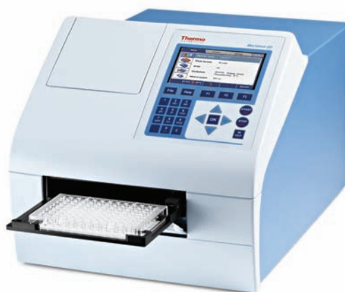
Thermo Scientific Multiskan GO without cuvette port