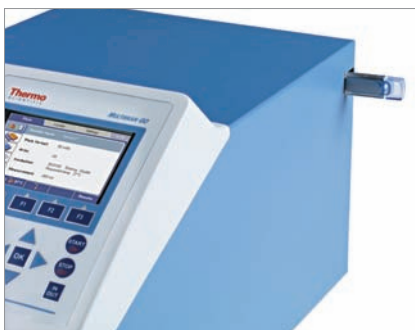
USB port for easy data transfer