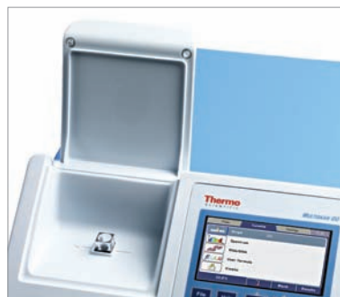
Multiskan GO accepts versatile cuvettes