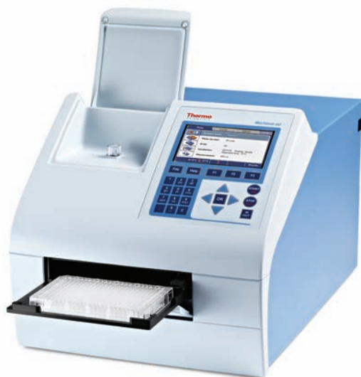
Thermo Scientific Multiskan GO with cuvette port

The Multiskan GO can be controlled without a computer using the visual internal software and its large color display making it convenient for quick and simple measurements of both microplates and cuvettes. Ready-made sessions for measuring DNA and RNA concentrations