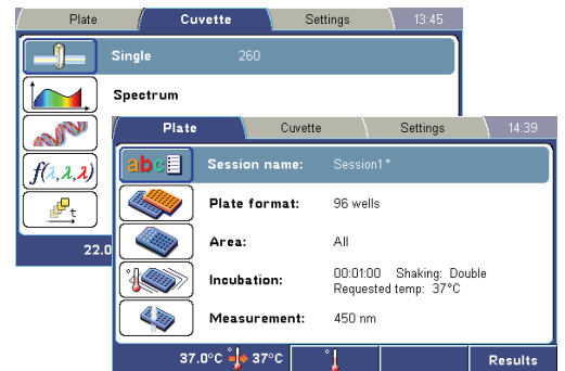
Easy to use internal software for quick plate or cuvette measurements